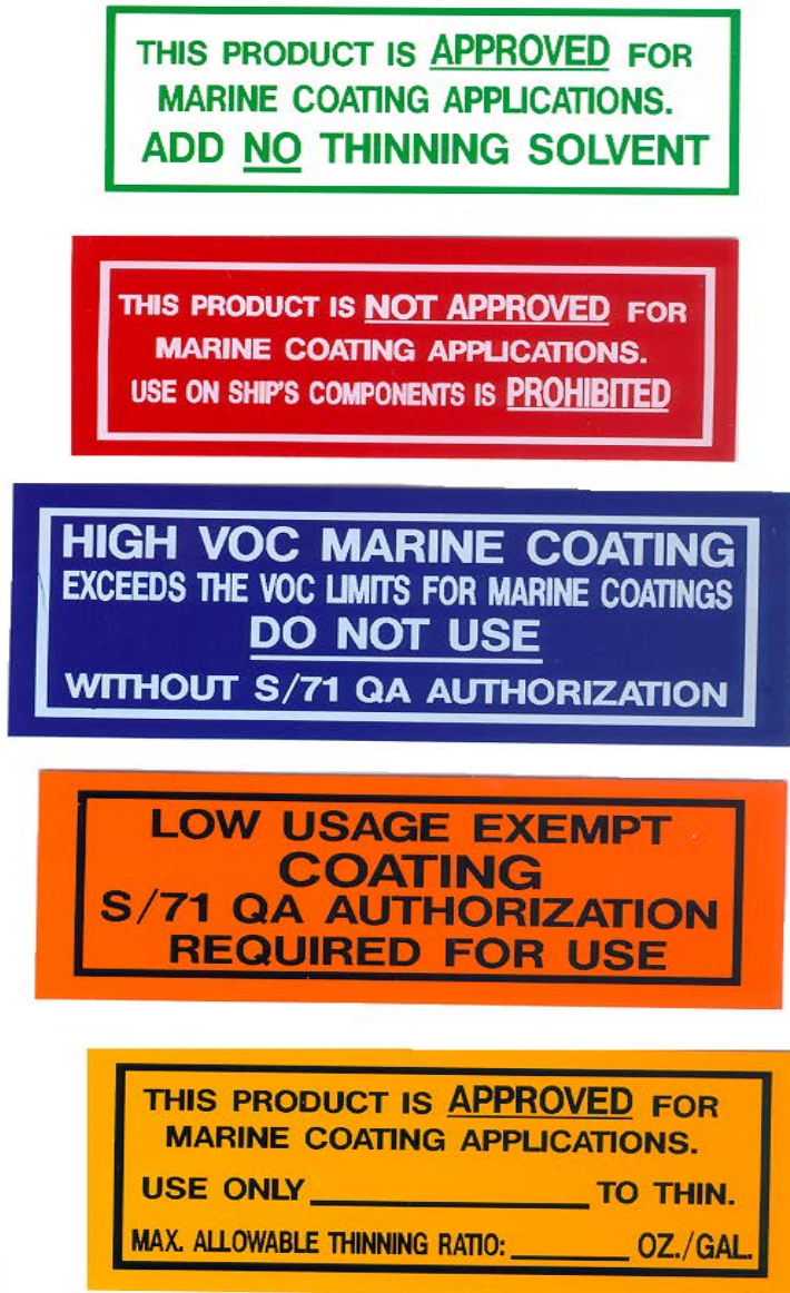
Figure 2. – Labels used on all coatings received by PSNS as per their compliance plan.