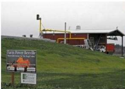
Dairy Digester (Farm Power Rexville)