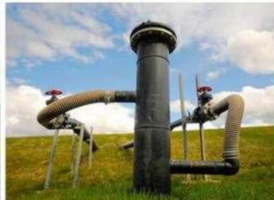
Landfill Methane Capture (King County Solid Waste Division)