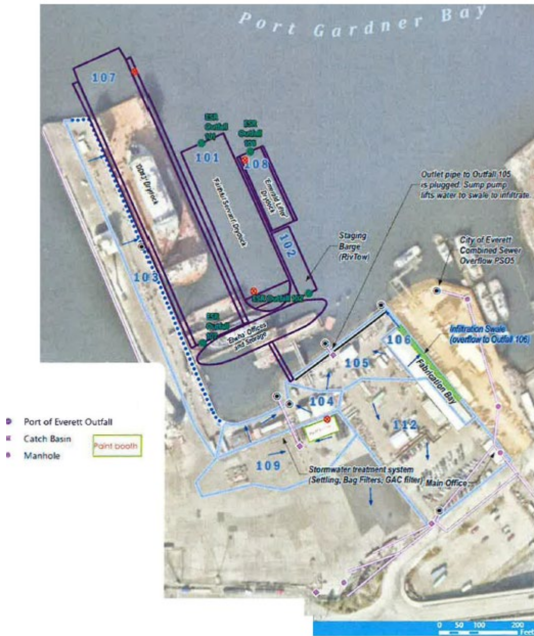
Figure 2. Everett Ship Repair Site Layout